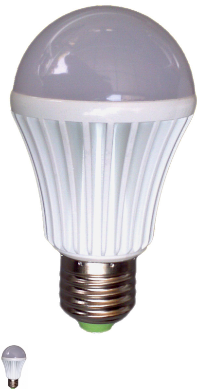
SMART LED Bulb 9W

Rating: Not Rated Yet Ask a question about this product