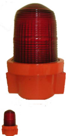
SMART LED Obstruction Light 6W

Rating: Not Rated Yet Ask a question about this product